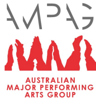
Australian Major Performing Arts Group