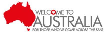
Welcome to Australia