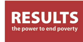
RESULTS International (Australia) Inc.