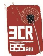
3CR Community Radio Station