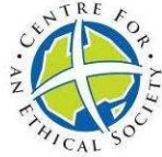
Centre for an Ethical Society