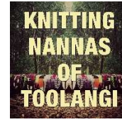
Knitting Nannas of Toolangi