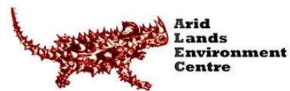
Arid Lands Environment Centre