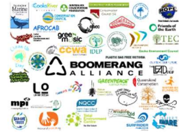
Boomerang Alliance (representing the groups in this graphic)