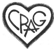
Combined Refugee Action Group