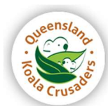
Queensland Koala Crusaders Inc.