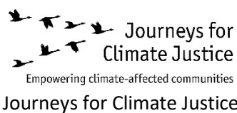
Journeys for Climate Justice