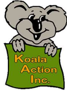
Koala Action Inc.