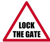
Lock the Gate