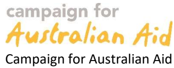
Campaign for Australian Aid