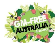
GM-Free Australia Alliance