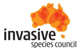
Invasive Species Council