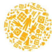
SolarCitizens Solar Citizens