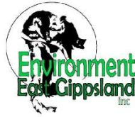
Environment East Gippsland