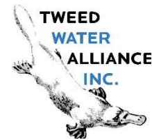
Tweed Water Alliance Inc.