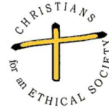
Christians for an Ethical Society