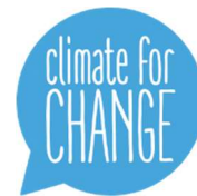
Climate for Change