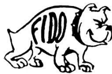
Fraser Island Defenders Organisation